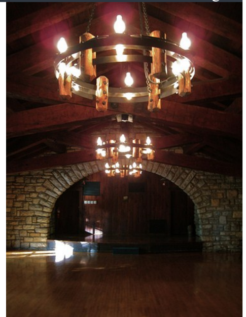
The ballroom at beautiful James P. Davis Hall.

(note: you should not rely solely on this article in claiming deductions on your Schedule C)